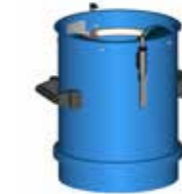
43160101 NCF 1.6, S50, with candle filter