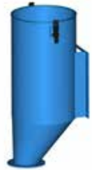
43413026 Silo S50 for wall, without inlet