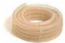
40377090 Hose PU12, ø63 mm L=2,5 m