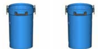
43334001 Container S50, with eccentric fasteners 67 liters 43332001 Container S50, with eccentric fasteners 47 liters