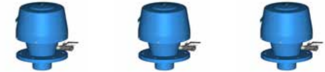
43051004 NE52, with S50 lid and 2 quick couplings 43051005 NE64, with S50 lid and 2 quick couplings 43051006 NE74, with S50 lid and 2 quick couplings